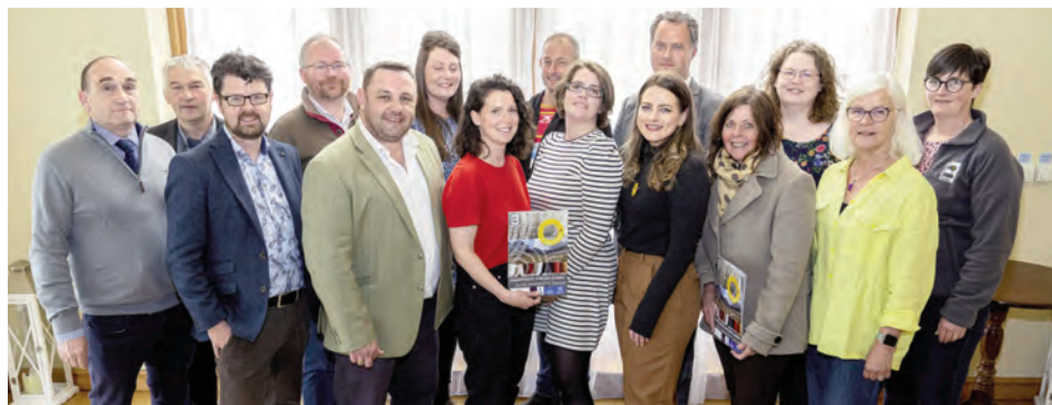
Grŵp a ddaeth ynghyd yn y Drenewydd beth amser yn ôl.

multi-use material. Publicity has already been given to the work, and more information will be given over the next few months.