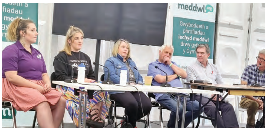
A panel discussion run by Meddwl about the importance of farmers and those working in agriculture talking and asking for help.