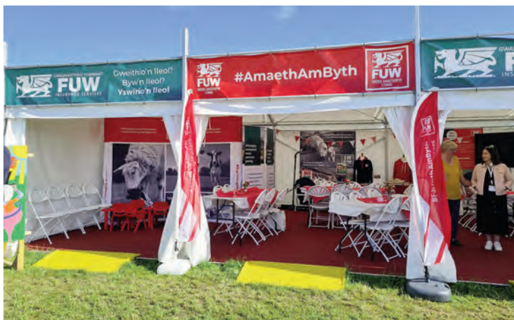
Stondin UAC yn yr Eisteddfod Genedlaethol yn Nhregaron eleni.

Yn y bore roeddwn yn bresennol mewn digwyddiad ynghylch "Ein hiechyd meddwl" gan y to ifanc o Senedd Ieuenctid Cymru. Ymhlith eu pryderon oedd