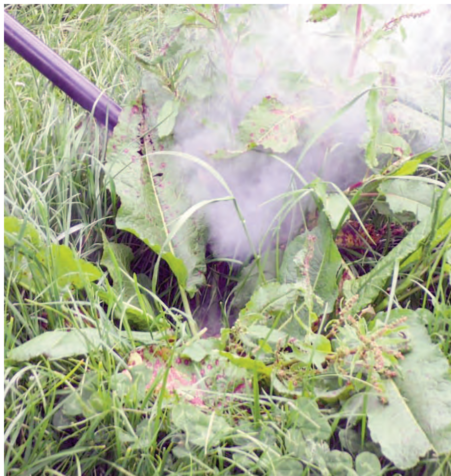
Water being evaporated in the plant tissue. Each dock plant in a plot was touched with the charged lance for approximately 5-10 seconds before moving on to the next plant.

EIP Wales, which is delivered by Menter a Busnes, has received funding through the Welsh Government Rural Communities - Rural Development Programme 2014-2020, which is funded by the European Agricultural Fund for Rural Development and the Welsh Government.